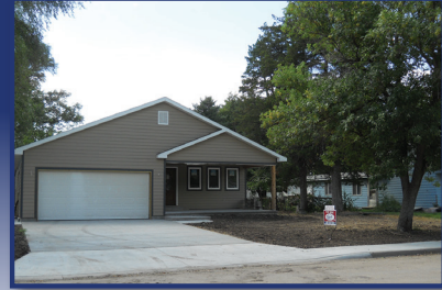
1607 N Madison St. | Lexington $217,500