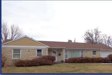
1500 N. Jackson St. | Lexington $139,900