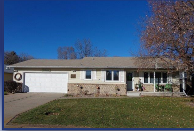
933 W. 12th St. | Lexington $152,000