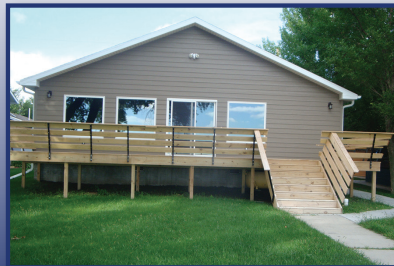
21 Northeast Cove, Dr. 9 | Johnson Lake $399,000