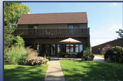
12 East Shore, Dr. 1B | Johnson Lake $625,000