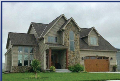
2013 Patriot Dr. | Lexington $305,000